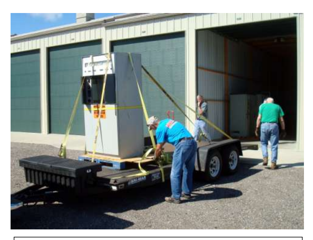
AACLA Volunteers and Board Members taking delivery of a 1961 Collins 20V-3 AM Broadcast Transmitter