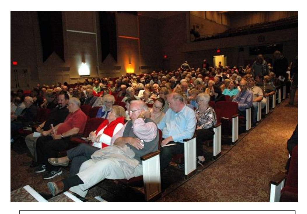
The audience at Coe College Sinclair Auditorium for the premier showing of "The Arthur A. Collins Legacy - A Culture of Innovation" October 9, 2015