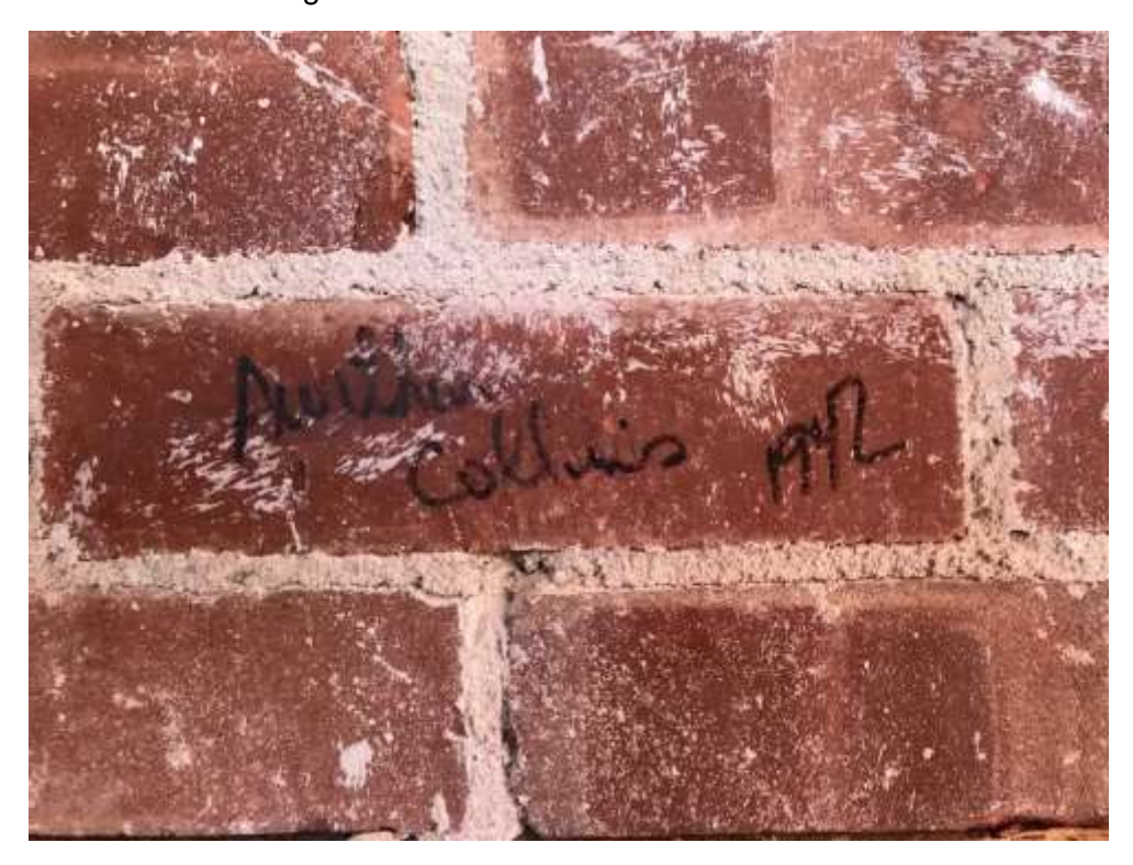
Arthur Collins' Signature found on original brick wall at Main Plant Entrance