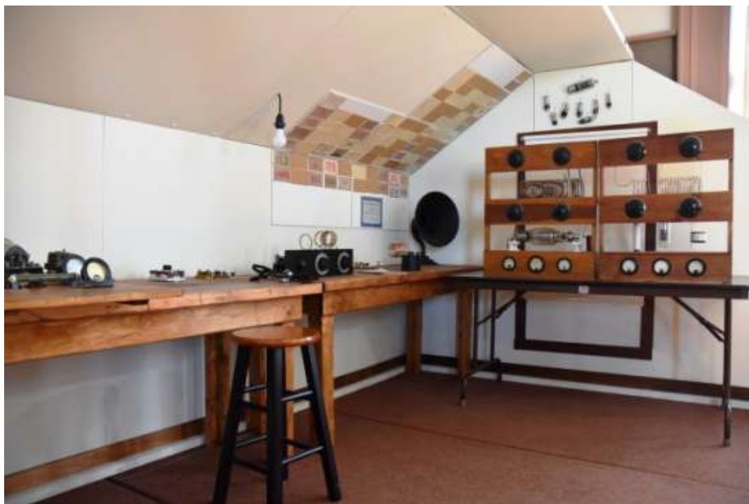
Exhibit of the Replica of Arthur Collins' 1925 Attic Ham Station