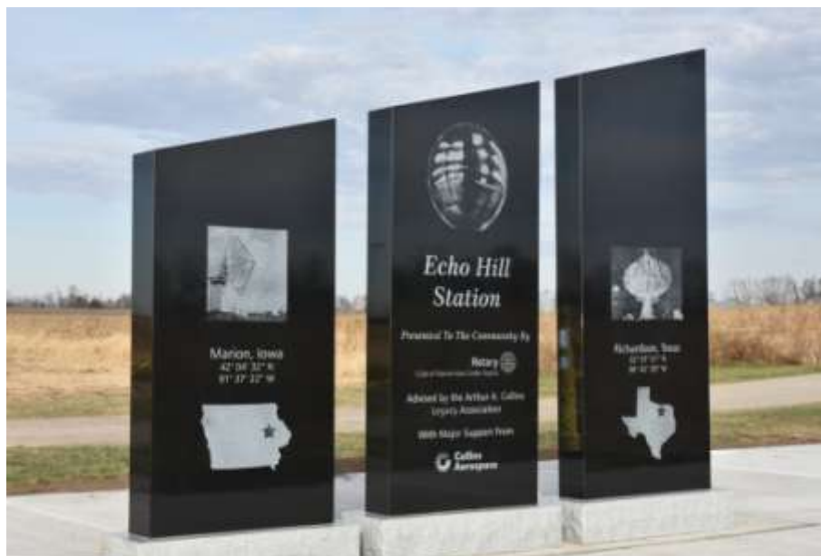
Reverse Side of the Monument