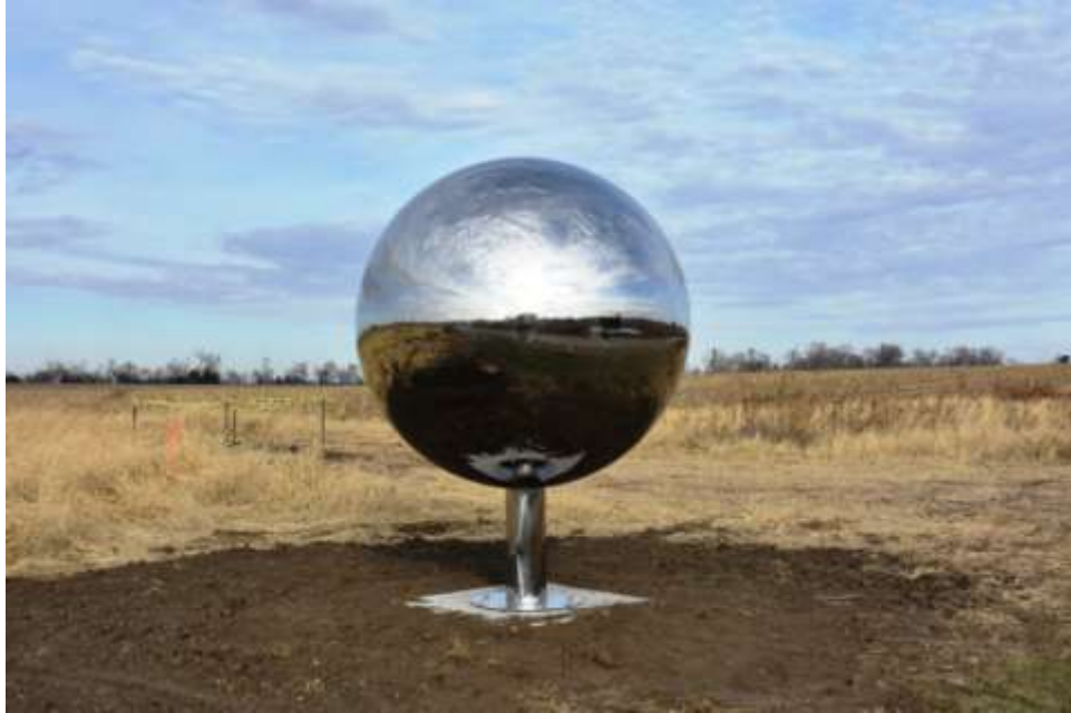
A Large Reflecting Sphere Represents the Echo Satellite