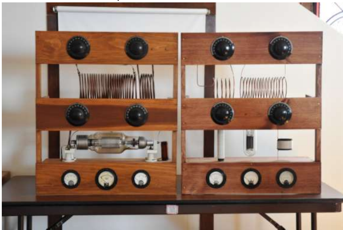
Replica 1925 Collins Transmitters