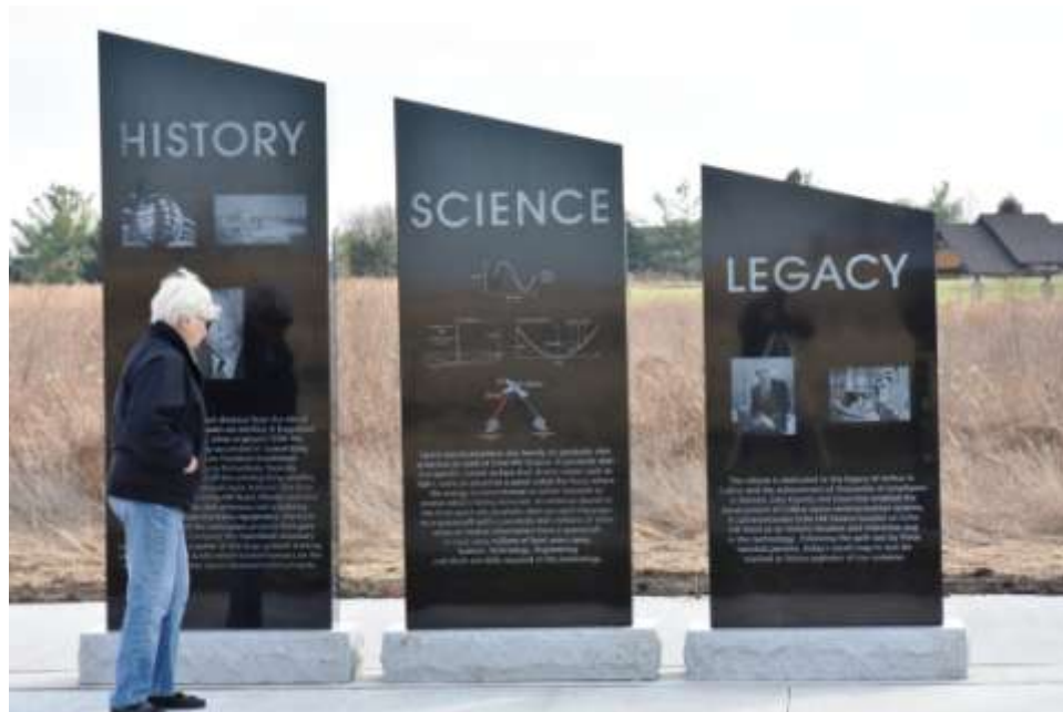
Monument to Echo Satellite Historic Communications by Collins Radio