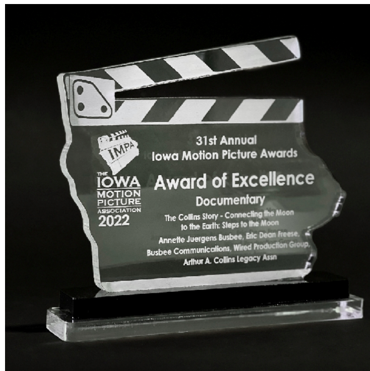
Iowa Motion Picture Award for Steps to the Moon